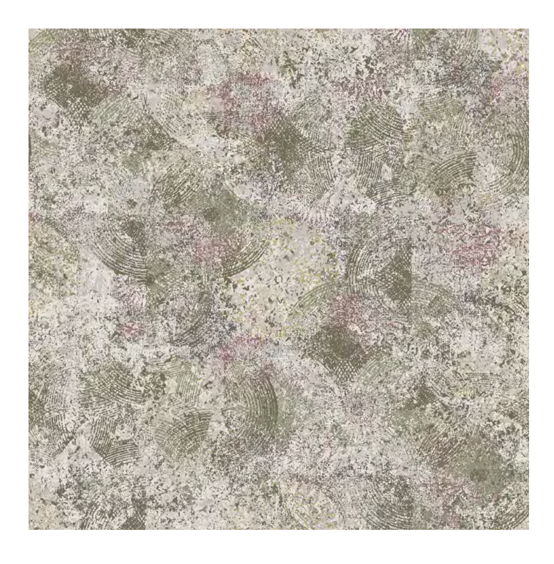
Design Size 3ft 3.37" x 3ft 3.37" 1.00m x 1.00m Metric 1 by 1 Repeats